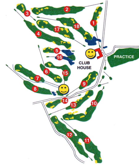
Points de raliement